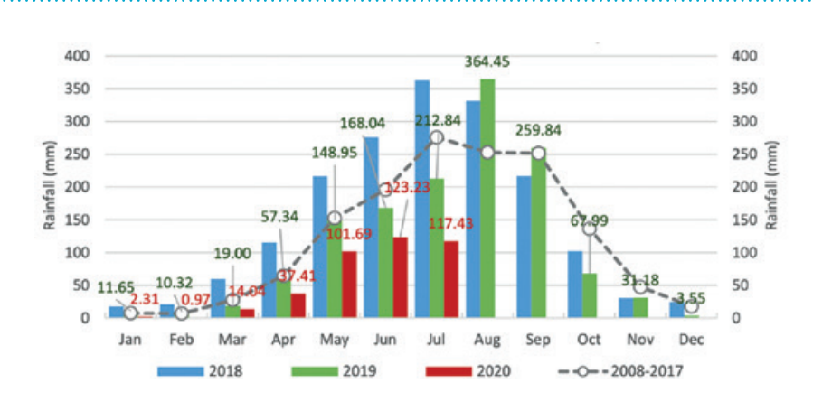
Figure 5.2. Overall monthly rainfall of 2018–2020 over the Lower Mekong Basin compared to the long-term condition of 2008–2017